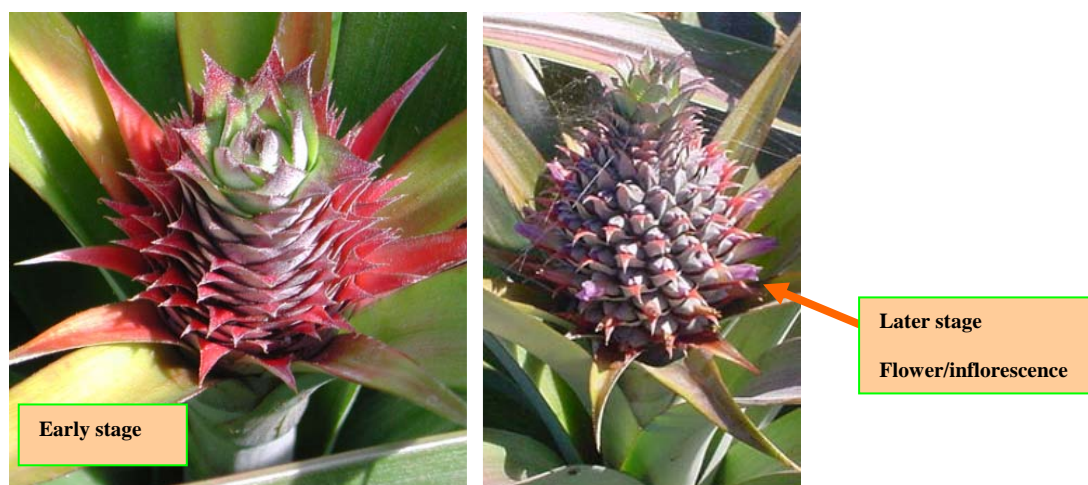
Figure 3.

Pineapple flowers do not abscise; the petals, stamens and style wither and the entire flower develops parthenocarpically into a berry-like fruitlet. The fruit of pineapple is a seedless syncarp and polygonal in shape. A syncarp is derived from the fusion of many individual flowers/fruitlets into one fruit. The fruit consists of the fused ovaries, bases of sepals and bracts, and cortex of the central core. In the mature fruit, the bract, sepal and ovary tissues are prominent (Medina & Garcia 2005). A 20-fold increase in weight occurs during the growth from flower to fruit.