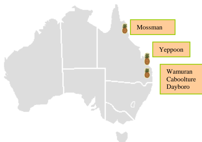
Figure 1. Map taken from Australian, States and Territories Map (2007) ( http://www.gov.au/sites/index.html ). Location of places on the map is only to give a broad idea of pineapple cultivation areas in Queensland.

Australia exported 1t canned fresh fruit to Hong Kong and East Timor during 2004/05 (Rohrbach et al. 2003; QDPI 2007). Pineapple production reached 139kilo t (kt) worth $44m in 1999/00, while in 2004/05 production decreased to 110kt (worth $37m) and 104kt respectively (DAFF 2007b). Table 2 indicates the pineapple yield in t/ha and the number of hectares under cultivation during 2001-05 in Queensland.